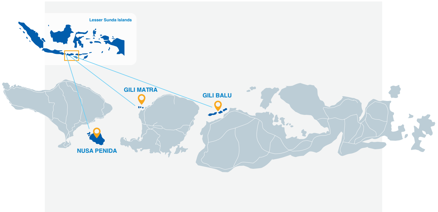
Figure 1 Three Project Sites in Lesser Sunda islands