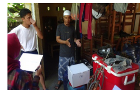
The joint Project assets check visit Gili Matra, NTB to check the completeness of the project assets and function of the assets.