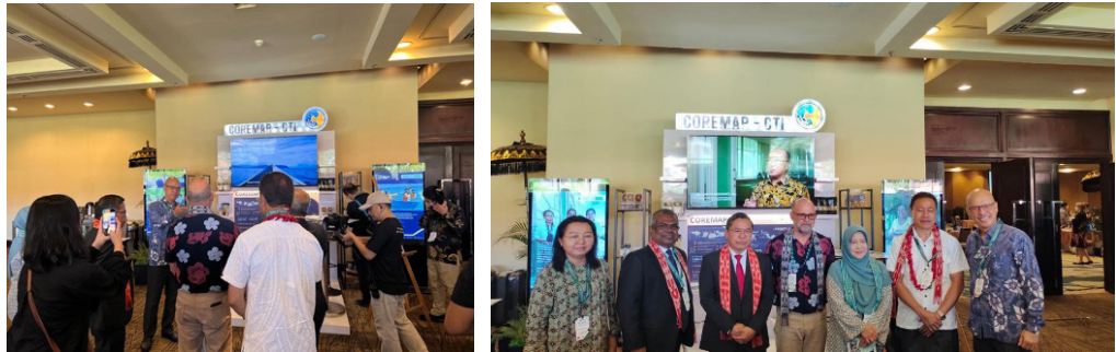
The Executive Director ICCTF – Bappenas presented the COREMAP CTI Project to the representative GEF Member Country who attended the GEF Asia – Pacific Regional Workshop, Bali 9-13 January 2023

Beside of that, the representative of GEF Member Countries also have opportunity to visit the Nusa Penida as the Project site of COREMAP CTI.