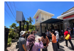
The Joint Project Assets Team visit Nusa Penida, Bali to check the completeness of the project assets and function of the assets.